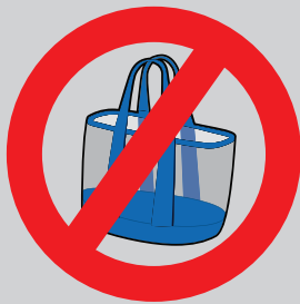
Oversized Tote Bag