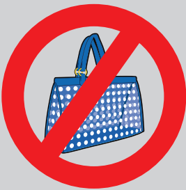
Printed Pattern Plastic Bag