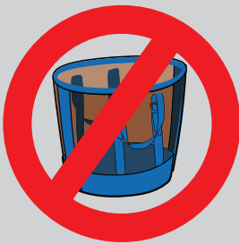
Tinted Plastic Bag

Please visit www.detroitlions.com for a complete list of prohibited items.