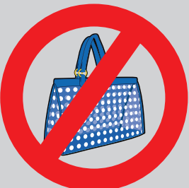
Printed Pattern Plastic Bag