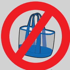
Oversized Tote Bag