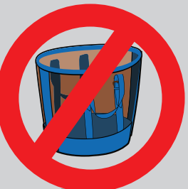
Tinted Plastic Bag