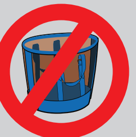
Tinted Plastic Bag