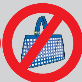
Printed Pattern Plastic Bag