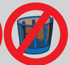
Tinted Plastic Bag