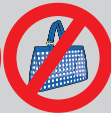
Printed Pattern Plastic Bag