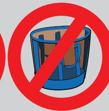
Tinted Plastic Bag

Please visit www.fordfield.com for a complete list of prohibited items.